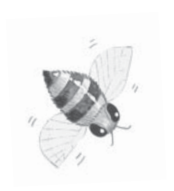
Rules of the memory course are found on pages 34 and 35.